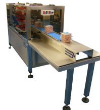
Pack Handling Systems