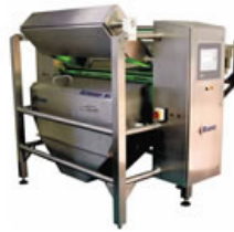
Colour Sorting Systems